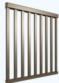
PICKETS: 5/8" and 1-1/2" pickets