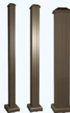
POSTS 2-1/4", 3" and 5-1/2" posts

WHITE, DESERT SAND, EARTHSTONE, BLACK ONLY aluminum is used - no plastic - to assure strength and durability