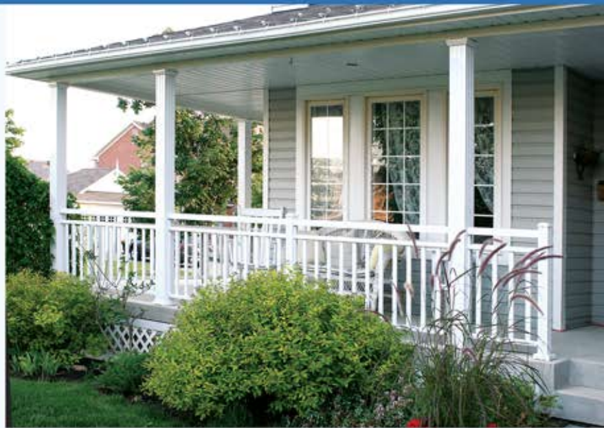
Classic styling, maintenance-free finish and structural strength!

In addition to looking lovely on your home, you have the comfort of knowing our railings have passed the structural tests necessary to meet all national building codes!