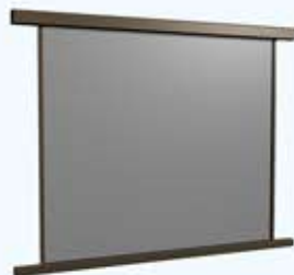
TEMPERED GLASS clear, tinted or frosted