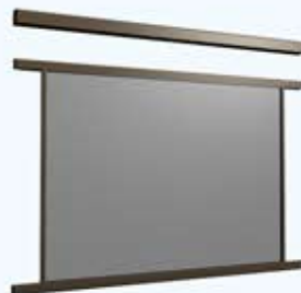
DOUBLE TOP RAIL for picket or glass systems