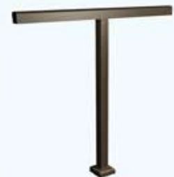
CROSS-OVER POST Mid-post