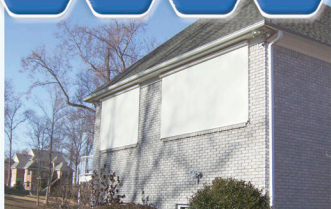
Solar Shades blocking the heat of the sun from entering the home