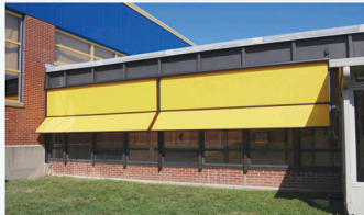
Solar Shades with awning on commercial property