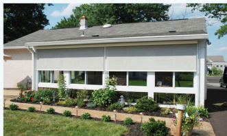
Solar Shades on a Betterliving Sunroom