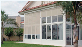
Shades operated together or independent - you decide!